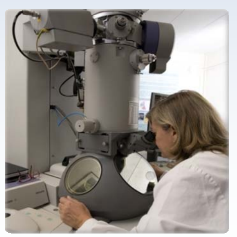
Publisher: ISCIII, Spain