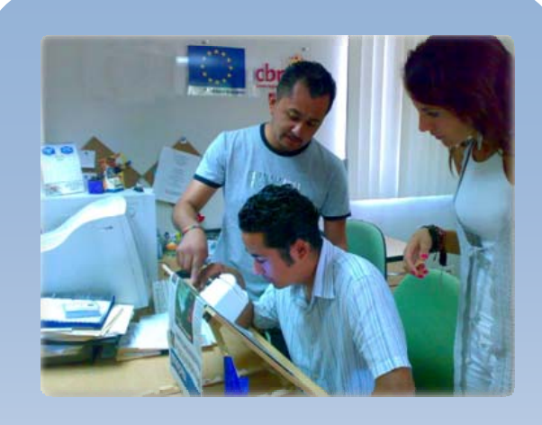
Publisher: Delegation of the EC, Mexico

Scenario Gap Roadmap Building Analysis definition