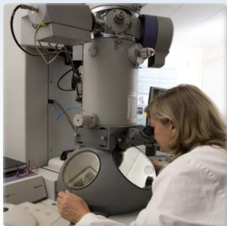
Publisher: ISCIII, Spain