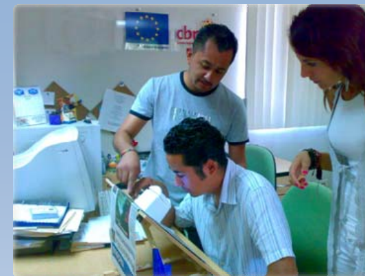
Publisher: Delegation of the EC, Mexico