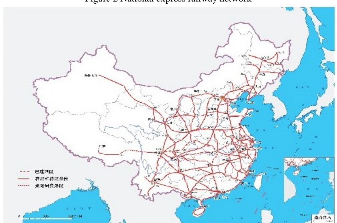
Figure 2 National express railway network

Column 7 Priorities of traffic construction, Xinhua News Agency