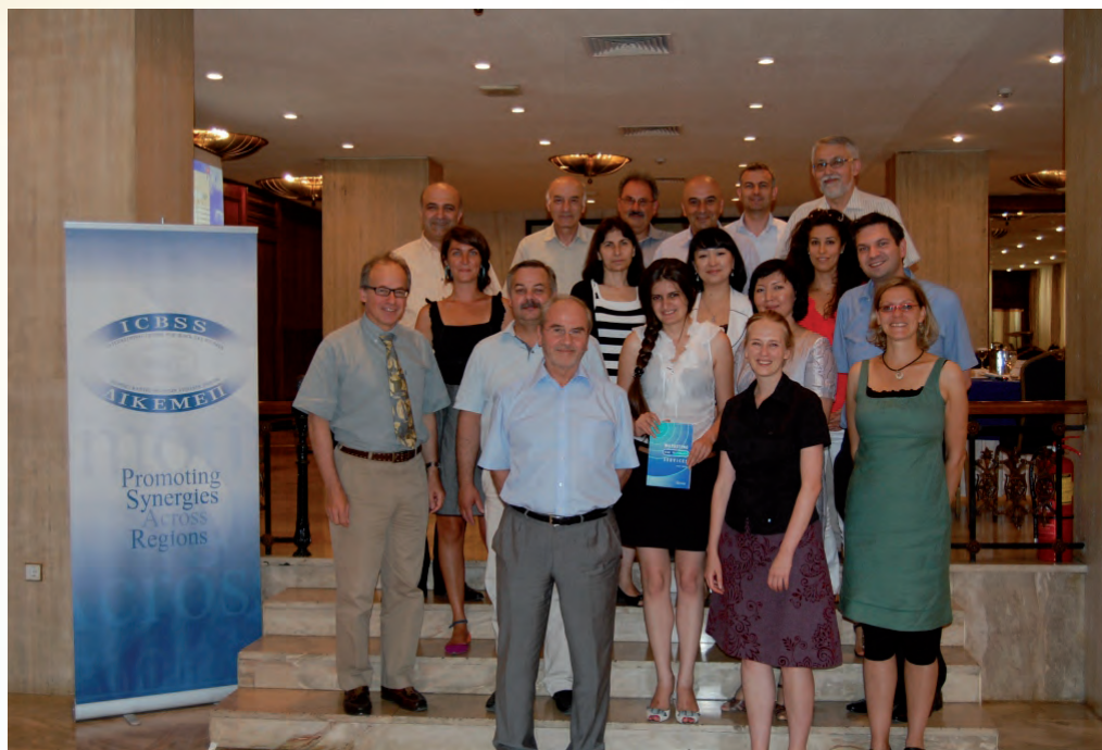
task group for the Benchmarking Exercise at a meeting in Athens in May 2012

That is why WP9-Pilot Evaluation Exercises the Benchmarking of RTDI in the field of nano-science and nanotechnologies were carried out in Kazakhstan, Armenia, Bulgaria, and Belorussia within the frame of the IncoNet EECA project.