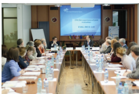
workshop impression

The regional workshop on 'Evaluation & Expertise for Scientific Excellence in the Eastern Partnership region' was held in Chisinau in on 7-8 May 2014. The event was organised by the Center of International Projects of the Academy of Sciences of Moldova (CIP) and the Austrian Centre for Social Innovation (ZSI) and brought together more than 35 experts working at R&D funding agencies from the Eastern Partnership countries, and relevant experts from Austria and Germany.