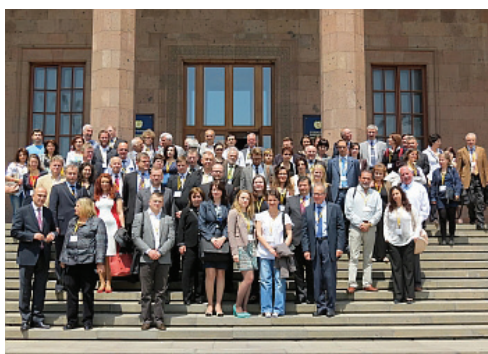
Participants at the PSC in Yerevan

The first IncoNet EaP Policy Stakeholders' Conference successfully organised by IncoNet EaP took place in Yerevan on 15-16 May 2014. It was hosted by the National Academy of Sciences of Armenia (NAS RA). The focus of the Conference was on the EU-EaP STI cooperation in addressing the Societal Challenge of Climate Change.